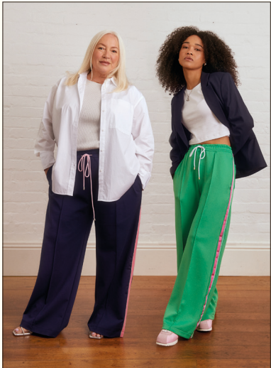
the calla trousers

We would love to see your calla trousers —use the hashtag #FGCalla on social media so we can admire your work!